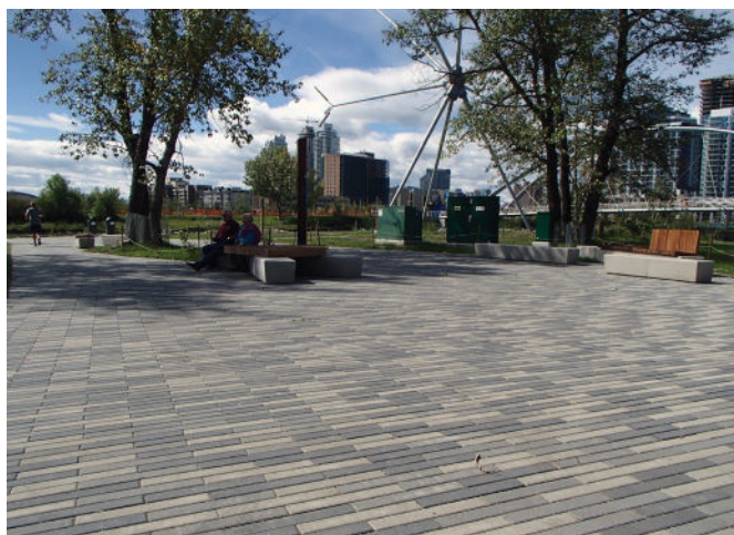
Figure 1. Concrete paving slabs can create certain moods and enhance the character of a project.