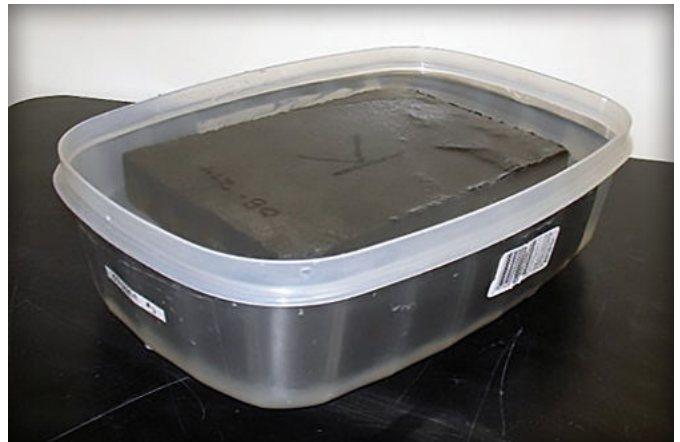
Figure 3. Test specimen from a slab immersed in a 3% saline solution ready for exposure to laboratory freeze-thaw cycles.

To emphasize differences in their ability to receive repeated vehicular loads, compare the total number of lifetime 18,000 lb. (80 kN) equivalent single axle loads (ESALs) in the base thickness design tables in CMHA Tech Note PAV-TEC-004—Structural Design of Interlocking Concrete Pavement to those in this bulletin. This Tech Note provides structural designs up to 10 million ESALs whereas the maximum in this bulletin for paving slabs and planks is 30,000 ESALs. This indicates that paving slabs and planks are exposed to limited vehicular traffic, and especially a limited number of trucks.