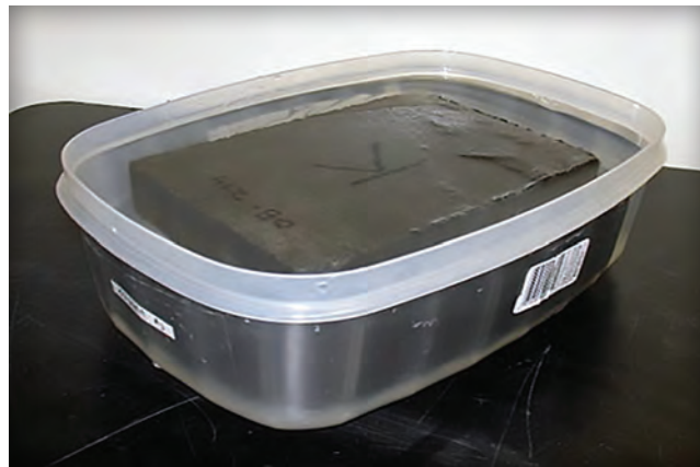
Figure 3. Test specimen from a slab immersed in a 3% saline solution ready for exposure to laboratory freeze-thaw cycles.

Segmental concrete paving slabs are sometimes mistakenly called concrete pavers or simply pavers. This has led to past misapplication of paving slabs in areas with substantial vehicular loads where interlocking concrete pavers should have been used. While concrete pavers and paving slabs are used in pedestrian applications, slabs are primarily for pedestrian use and limited vehicular traffic. Very large and thick slabs (called mega-slabs or large format paving units) have been used in some urban vehicular