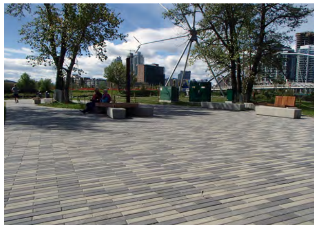
Figure 1. Concrete paving slabs can create certain moods and enhance the character of a project.