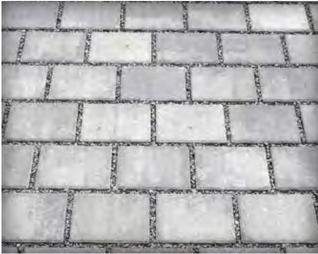
Figure 4. Keeping PICP joints filled with permeable aggregate facilitates removal of accumulated sediment.