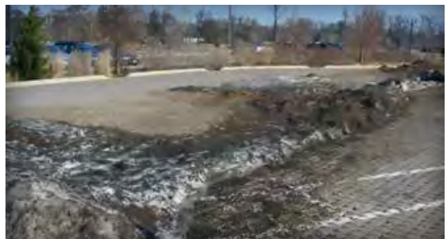
Figure 26. This is an example of snow that should have been deposited on a grassy area. If such areas are not available, then vacuum clean the PICP in the early spring.

A 2020 University of Toronto study on pavement deicing operations quantified some significant winter safety benefits when using PICP. Besides confirming that the use of permeable pavers can eliminate the occurrence of snow melt refreezing and forming black ice, snow and ice can also melt and dry quicker when deicers are used on PICP. More importantly, the research confirmed that a much lower deicing salt application rate is required on PICP compared to impervious asphalt, while still maintaining a high level