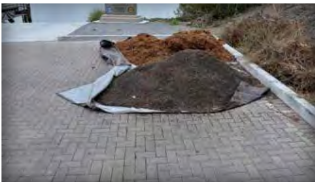
Figure 5. Mulch placed on tarps prevents more expensive cleaning of PICP.

Sand used in the winter for traction is not recommended. Figure 6 illustrates the consequence to PICP joints when subjected to winter sand for traction. If used, sand should be removed with vacuuming in the spring to prevent a substantial decrease in surface infiltration. Using jointing aggregate is recommended as a better alternative to using sand for winter traction. In addition, the aggregate can provide some refilling of the joints.