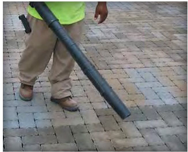
Figure 15. Blowing debris to curbs or gutters for removal and disposal.