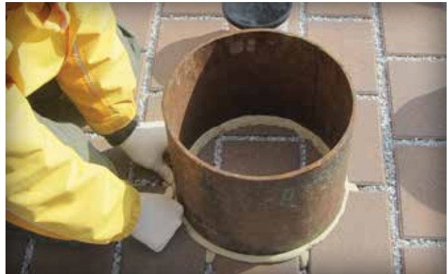
Figure 12. Steps in setting up test equipment for measuring surface infiltration using ASTM C1781.