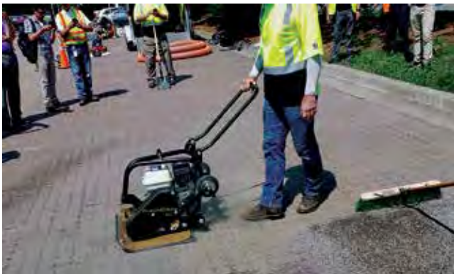
Figure 25. No matter the equipment used, after removing sediment soiled aggregate, clean aggregate is placed in the joints, the surfaced cleaned and compacted.