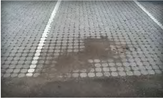
Figure 10. Erosion of adjacent asphalt and sediment deposition on PICP.