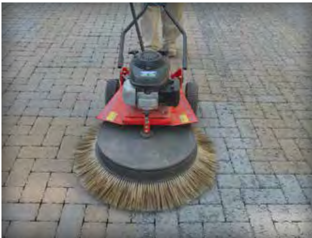
Figure 16. Rotary brushes increase cleaning efficiencies.