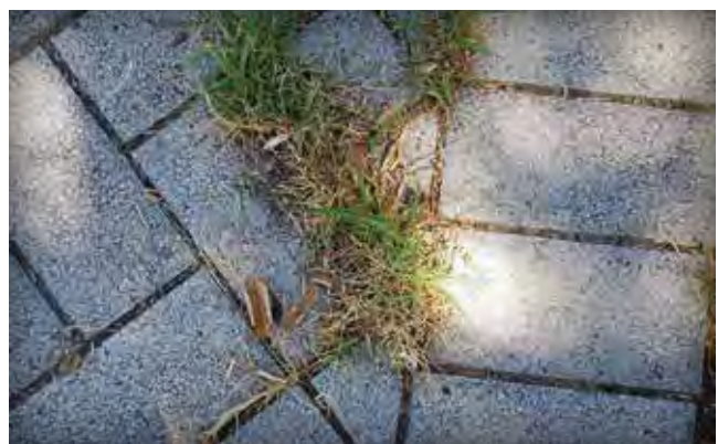
Figure 9. Weeds indicate sediment accumulation and lack of surface cleaning to remove it.

Test Surface Infiltration —A quick and subjective test for the amount of surface infiltration is pouring water on PICP. If the water spreads rather than infiltrates, the extent of spreading suggests an area that may be clogging. Should more than approximately 20% of the surface area see ponding during or immediately after a rainstorm, a more objective measure of surface infiltration of these areas can be accomplished using ASTM C1781 Standard Test Method for Surface Infiltration Rate of Permeable Unit Pavement Systems . Figure 12 illustrates the test set up using a 12 in. (300 mm) diameter ring set on plumber's putty. (The ring can be metal or plastic.) Figure 13 illustrates the test apparatus in