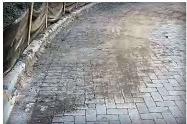
Figure 3. Whether eroded onto or dumped on PICP, erosion and sediment control are essential during construction.

Filled paver joints means filled to the bottom of the paver chamfers with jointing stone. If the pavers have very