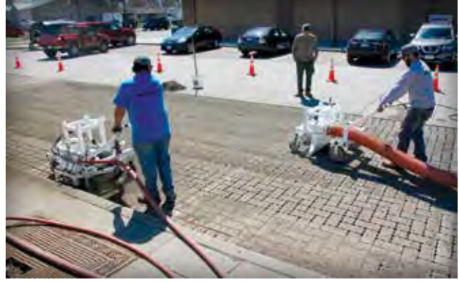
Figure 24. This equipment blows sediment and soiled aggregate from the joints and uses vacuum equipment to remove them.