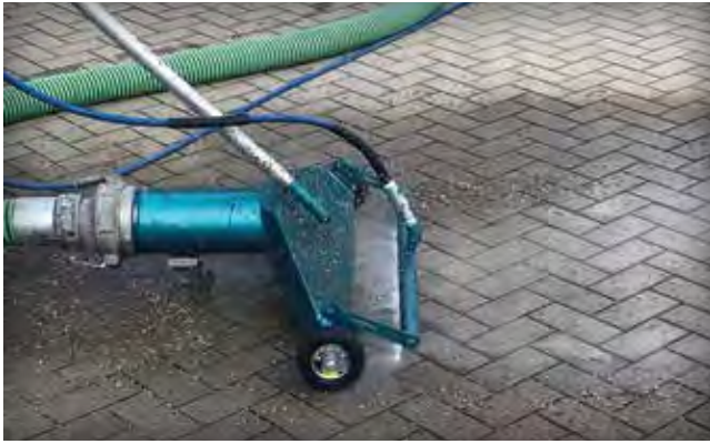
Figure 23. This equipment provides combined washing and vacuum of unmaintained PICP.