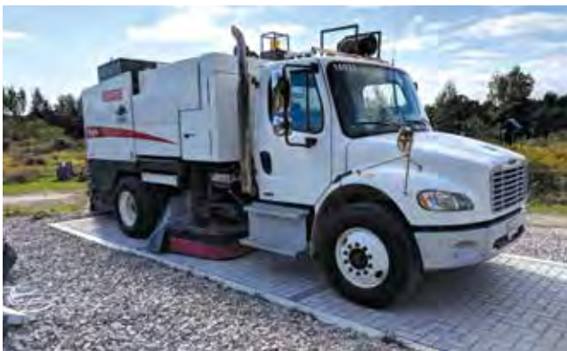
Figure 20. This type of mechanical sweeper removes sediment from joints parallel to the direction of the broom rotation.

In 2020, the University of Toronto completed a two year research project, Maintenance Equipment Testing on Accelerated Clogged Permeable Interlocking Concrete