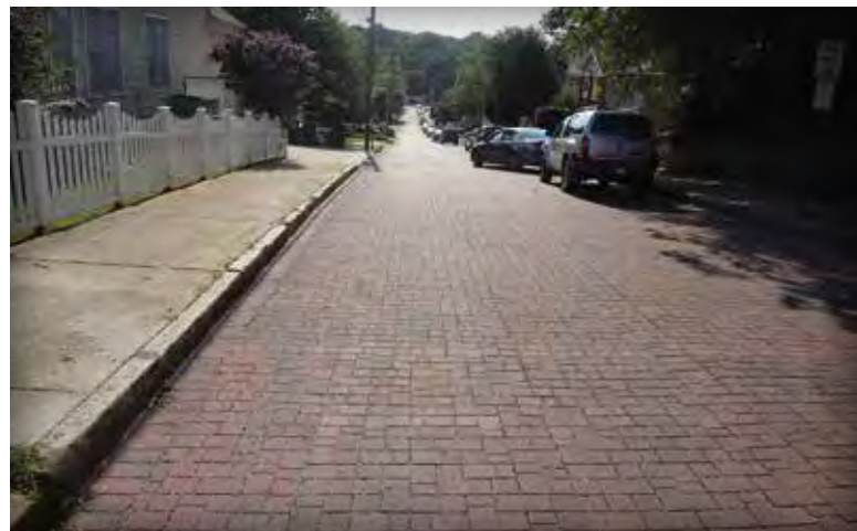
Figure 1. PICP is seeing increased use in municipal streets to reduce stormwater runoff, local flooding, storm pipe upsizing, and combined sewer overflows. These streets are in Atlanta, GA.