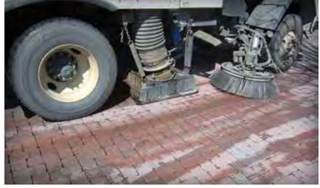
Figure 21. A regenerative air machine does routine cleaning in a PICP parking lot.