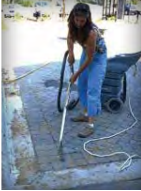
Figure 17. Wet/dry shop vacuum cleans loose sediment from a PICP residential driveway