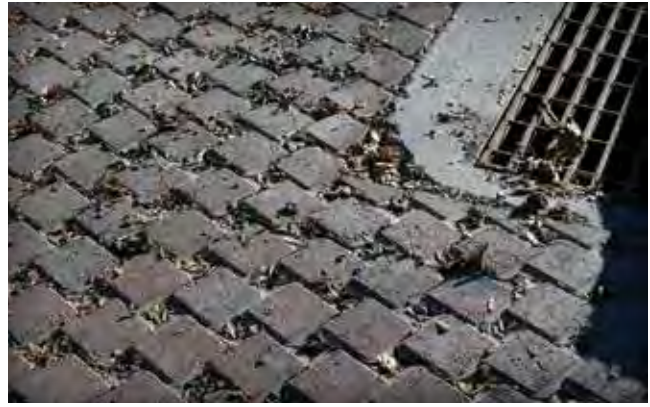
Figures 7 and 8. Pine needles and leaves eventually will degrade and get compacted into the joints from traffic. They should be removed by sweeping or vacuuming before that happens.

mulated sediment. Weeds should be removed by hand. Herbicide may kill weeds, but dead vegetation and roots will remain. They typically reduce infiltration and should eventually be removed.