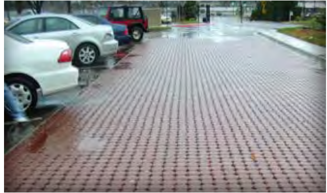
Figure 11. Ponding on PICP typically first occurs at the junction with impermeable pavement.