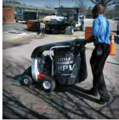
Figure 18. Walk-behind vacuum cleans a small parking area.