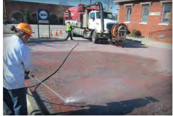
Figure 19. Power washing requires a little practice to minimize jointing stone removal.

High Pressure Air/Vacuum —High pressure air is blasted into the joints and has been shown to be very effective at dislodging sediment and debris. A second step is then required to vacuum up the debris that is dislodged. In Figure 24, the machine in the foreground blows debris completely out of the joints and the second machine takes up the debris into a vac truck similar to that used to clean catch basins. See Figure 24. As with all restorative cleaning methods, clean jointing stone is spread and the empty joints are filled. After removing excess stones from the surface, the pavers with filled joints are compacted with a minimum 5,000 lbf (22 kN) vibratory plate compactor operating at 75-90 Hz. See Figure 25. This helps settle the stones into the joints. Any joints where stones have settled should be filled with more stones within a 1/4 inch (5 mm) of the paver surfaces.