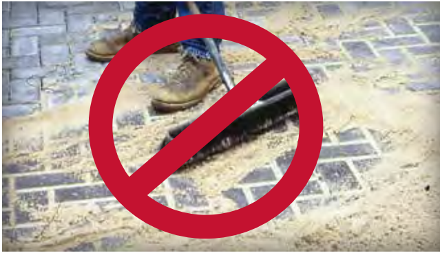
Figure 2. Sand-filled joints and bedding common to interlocking concrete pavement are not used in PICP.

tool on www.icpi.org/software to help identify favorable sites and avoid one that may incur additional maintenance.