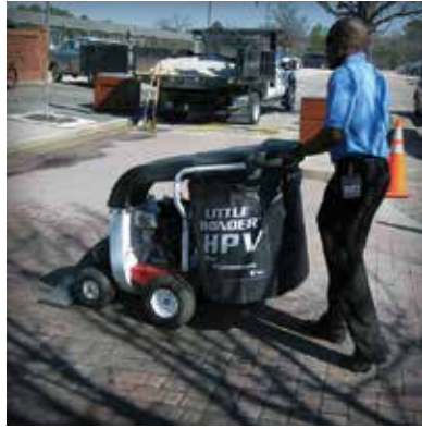
Figure 18. Walk-behind vacuum cleans a small parking area.