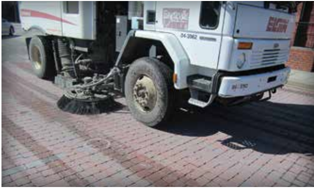
Figure 21. A regenerative air machine does routine cleaning in a PICP parking lot.