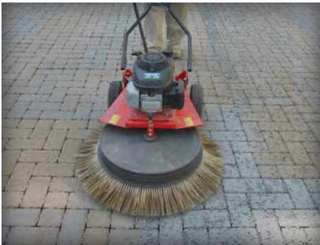
Figure 16. Rotary brushes increase cleaning efficiencies.