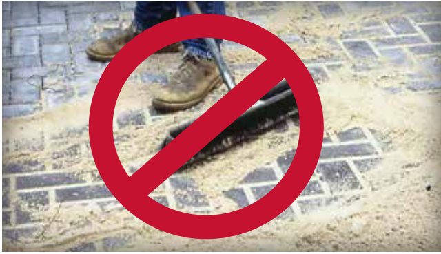
Figure 2. Sand-filled joints and bedding common to interlocking concrete pavement are not used in PICP.

Every PICP site varies in sediment deposition onto its surface, particle size distribution, and the resulting cleaning frequency. For example, beach sand (a coarse particle size distribution) on the surface will not clog as quickly and require less effort removing than fine clay sediment. Besides the particle size distribution, the rate of surface infiltration decline also depends on the traffic, size, and slope of a contributing impervious area, adjacent vegetation and eroding soil, paver joint widths and jointing stone sizes. ICPI offers a PICP site selection tool on www.icpi.org/resource-library/software-programs to help identify favorable sites and avoid one that may incur additional maintenance.