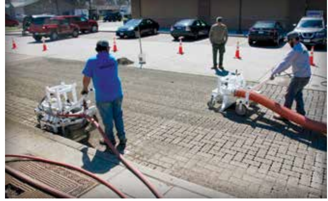
Figure 24. This equipment blows sediment and soiled aggregate from the joints and uses vacuum equipment to remove them.