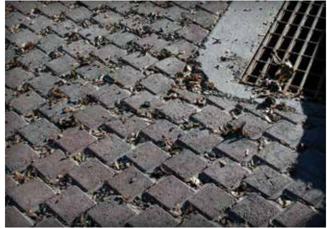
Figures 7 and 8. Pine needles and leaves eventually will degrade and get compacted into the joints from traffic. They should be removed by sweeping or vacuuming before that happens.

surface helps maintain infiltration. Figure 5 illustrates an example of correct management of landscaping material on PICP, as well as the need to exposed soil slopes.