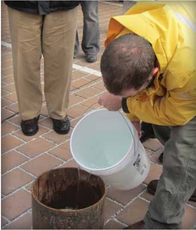
Figure 13. ASTM C1781: pouring the water into a 12 in. (300 mm) inside diameter ring set on plumber's putty.

ASTM C1781 test method begins with “pre-wetting” an area inside the ring to ensure the surface and materials beneath are wet. This is done by slowly pouring 8 lbs (3.6 kg) of water while not allowing the head of water on the paver surface to exceed 3/8 in. (10 mm) depth. If the time to infiltrate 8 lbs of water is less than 30 seconds (using a stopwatch typically on a cell phone), the subsequent test is done using 40 lbs (18 kg) of water. If more than 30 seconds, then 8 lbs of water is used in the subsequent tests. Again, a 3/8 in. (10 mm) head is maintained during the pour while being timed with a stopwatch. The surface infiltration rate is calculated using formulas in the test method.