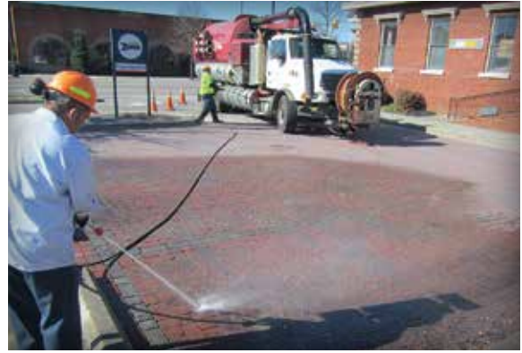
Figure 19. Power washing requires a little practice to minimize jointing stone removal.

opportunity on most sites to remove the water-suspended sediment before the water is absorbed back into the pavement. See Figure 19.