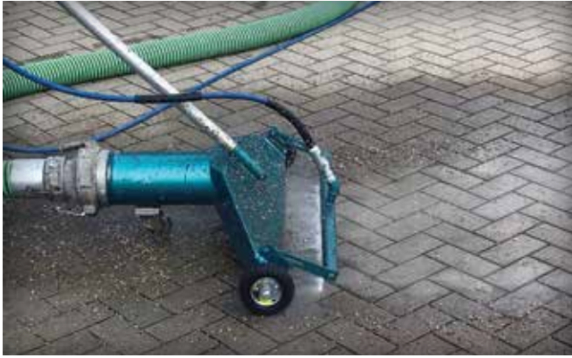
Figure 23. This equipment provides combined washing and vacuum of unmaintained PICP.