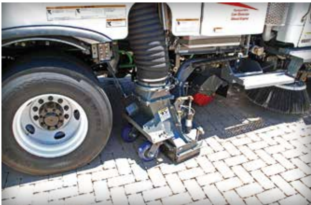
Figure 22. A true vacuum machine cleaning neglected PICP.