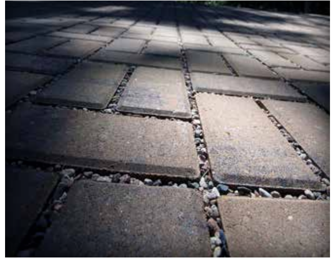
Figure 4. Keeping PICP joints filled with permeable aggregate facilitates removal of accumulated sediment.

jointing stones in the first few months is normal to PICP as open-graded aggregates for jointing and bedding choke into the larger base aggregates beneath and stabilize. This settlement often requires the joints to be refilled with aggregates three to six months after their initial installation. If possible, this should be included in the initial construction contract specifications. Aggregate-filled joints facilitate sediment removal at the surface.