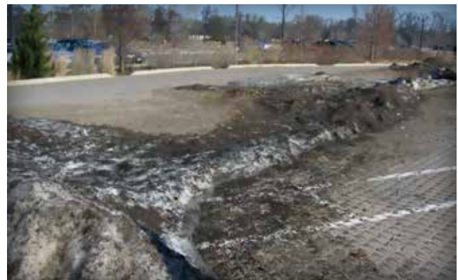
Figure 26. This is an example of snow that should have been deposited on a grassy area. If such areas are not available, then vacuum clean the PICP in the early spring.

Snow Removal —Unlike other permeable pavement surfaces, PICP demonstrates durability in the winter. PICP can be plowed with steel or hard rubber blades. Steel blades typically scratch all pavement surfaces. When using commercial snow removal companies, confirm in writing they provide protective edges on the snowplow equipment to avoid scratching the surface. Most pavers have chamfers on their surface edges which can help protect the edges from chipping by snow plows. For smaller areas, use a plastic snow shovel and fit snow blowers with plastic on the scoops and on the gliders. When possible deposit plowed snow onto grassy areas and not on the PICP when the plowed snow is dirty. Such dirt will remain and likely help clog the PICP surface after the snow melts.