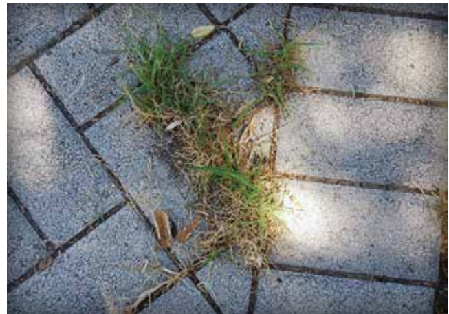
Figure 9. Weeds indicate sediment accumulation and lack of surface cleaning to remove it.

Inspect During and Just After a Rainstorm —The extent of puddles and bird baths observed during and especially after rainstorm indicate a need for surface cleaning. A minor amount of ponding is likely to occur particularly at transitions from impervious pavement surfaces to PICP. This often occurs first as sediment is transported by runoff and vehicles. See Figures 10 and 11. Should ponding areas occupy more than 20% of the entire PICP surface, then surface cleaning should be conducted. While a rainstorm's exact conclusion is difficult to predict, standing water on PICP for more than 15 minutes during or after a rainstorm likely indicates a location approaching clogging.