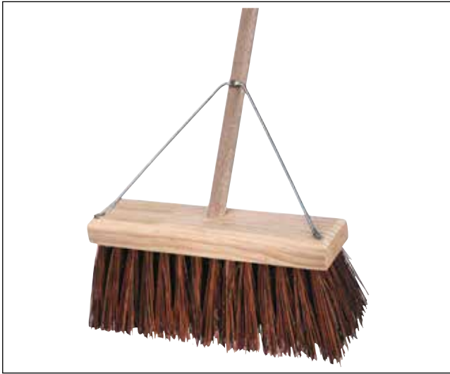
Figure 14. Bristle broom for removing loose debris