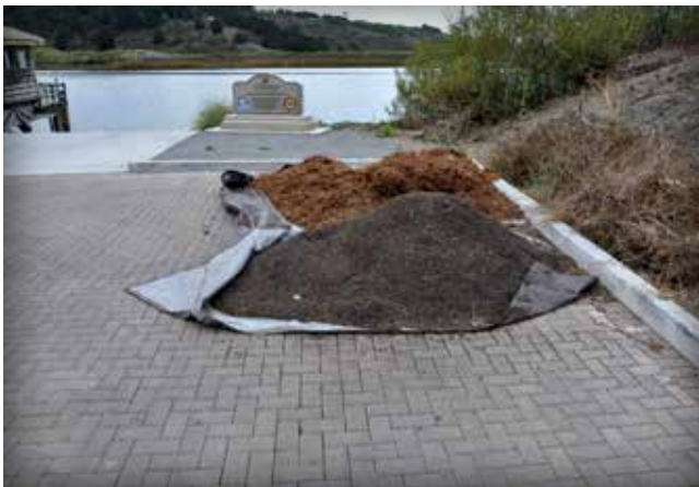
Figure 5. Mulch placed on tarps prevents more expensive cleaning of PICP.

Manage mulch, topsoil and winter sand. Finally, stockpiling mulch or topsoil on tarps or on other surfaces during site maintenance activities rather than directly on the PICP