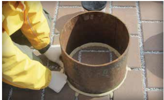
Figure 12. Steps in setting up test equipment for measuring surface infiltration using ASTM C1781.

Test Surface Infiltration —A quick and subjective test for the amount of surface infiltration is pouring water on PICP. If the water spreads rather than infiltrates, the extent of spreading suggests an area that may be clogging. Should more than approximately 20% of the surface area see ponding during or immediately after a rainstorm, a more objective measure of surface infiltration of these areas can