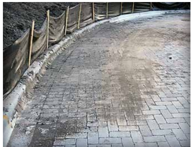
Figure 3. Whether eroded onto or dumped on PICP, erosion and sediment control are essential during construction.

Maintain filled joints with stones. The jointing stones capture sediment at the surface so it can easily be removed. If sediment is allowed to settle and consolidate, then cleaning becomes more difficult since the sediment is inside the joint rather than on the surface. Settlement of