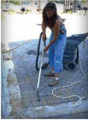
Figure 17. Wet/dry shop vacuum cleans loose sediment from a PICP residential driveway