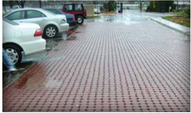
Figure 11. Ponding on PICP typically first occurs at the junction with impermeable pavement.