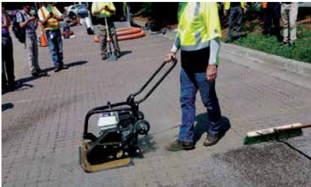
Figure 25. No matter the equipment used, after removing sediment soiled aggregate, clean aggregate is placed in the joints, the surfaced cleaned and compacted.