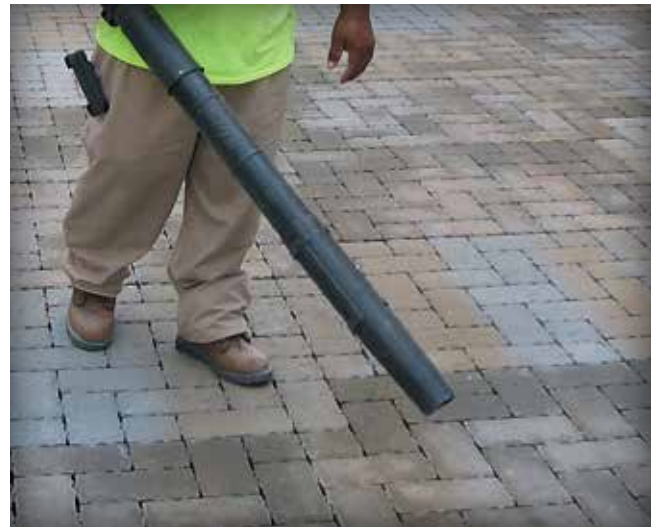
Figure 15. Blowing debris to curbs or gutters for removal and disposal.