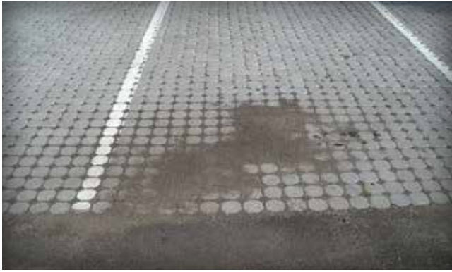
Figure 10. Erosion of adjacent asphalt and sediment deposition on PICP.