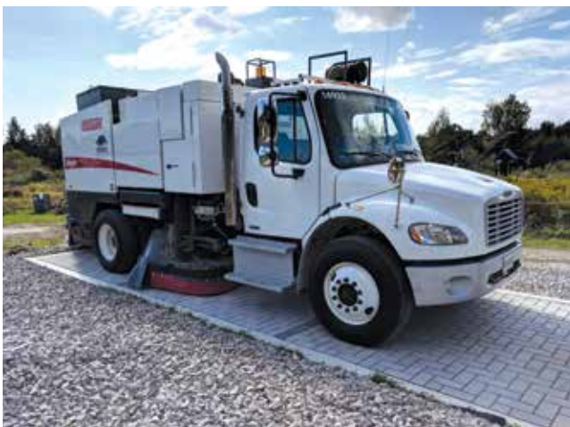
Figure 20. This type of mechanical sweeper removes sediment from joints parallel to the direction of the broom rotation.

Street Sweepers —These typically have rotating plastic bristle brushes positioned near the curb side and center pickup into a hopper at the rear. Do not use water as it slows removal of loose dirt into the machine. This machine does provide a small vacuum force to manage dust, but the cleaning action is provided by the mechanical sweeping, so it is moderately effective among large machines