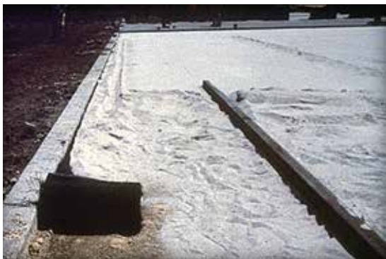
Figure 7. Woven geotextile used to contain bedding sand from migrating laterally. Visit www.icpi.org for detail drawings.

Interlocking concrete pavements should also be designed and constructed such that the bedding sand should not be able to migrate into the base, or laterally through the edge restraints. Dense-graded base aggregates with 5% to 12% fines (the amount passing the No. 200 or 0.075 mm sieve), will ensure that the bedding sand does not migrate down into the base surface. For pavements built over asphalt or con-