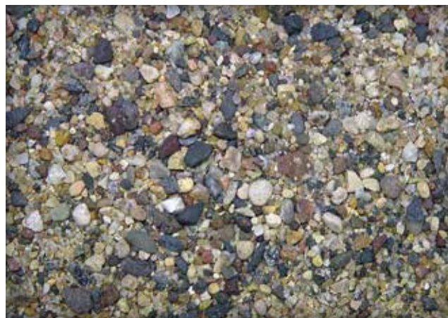
Figure 3. Example of sand from the ICPI bedding sand test program with a total combined percentage of sub-angular and sub-rounded particles equal to 65% according to ASTM D2488

Recommended Material Properties —Table 3 lists the primary and secondary material properties that should be considered when selecting bedding sands for vehicular applications. Bedding sands may exceed the gradation requirement for the maximum amount passing the No. 200 (0.075 mm) sieve as long as the sand meets degradation and permeability recommendations in Table 3. Micro-Deval degradation testing can be replaced with sodium sulfate or magnesium soundness testing as long as this test is accompanied by the other primary material property tests listed in Table 3. Other material properties listed, such as petrography and angularity testing are at the discretion of the specifier and may offer additional insight into bedding sand performance.