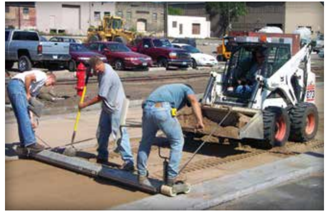
Figure 5. Mechanical screeding is the most efficient method of bedding sand installation

Role of Bedding Sand in Construction —Provided that the base was installed according to recommended construction practices and tolerances (See ICPI Tech Spec 2—Construction of Interlocking Concrete Pavements ), the bedding sand ensures that the pavers have a uniform slope and meet surface tolerances without surface undulations or “waviness.” Sand should be loosely screeded to a uniform thickness of 1 in. (25 mm) to 1½ in. (38 mm), which will compact to a thickness of ¾ in (19 mm) to 1¼ in (31 mm). for vehicular applications. Screeds can either be pulled by hand or by machine (mechanical screed) as shown in Figures 4 and 5. Mechanical screeding provides the most efficient method. Pavers are placed on the loose uncompacted sand. Contractors should select sand that allows the pavers to be uniformly seated during their initial compaction with a minimum 5000 lb (22kN) force plate compactor.