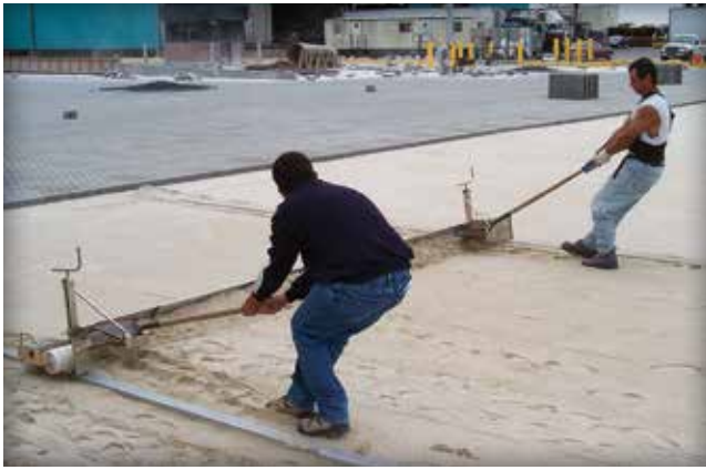
Figure 4. A two-man hand pulled screed