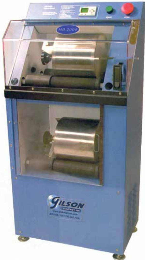
Figure 1. The Micro-Deval test apparatus.

Failure of the bedding sand layer occurs in channelized vehicular loads from two main actions; structural failure through degradation and saturation due to inadequate drainage. Since bedding sands are located high in the pavement structure, they are subjected to repeated applications of high stress from the passage of vehicles over the pavement (Beatty 1996). This repeated action, particularly from higher bus and truck axle loads, will degrade the bedding