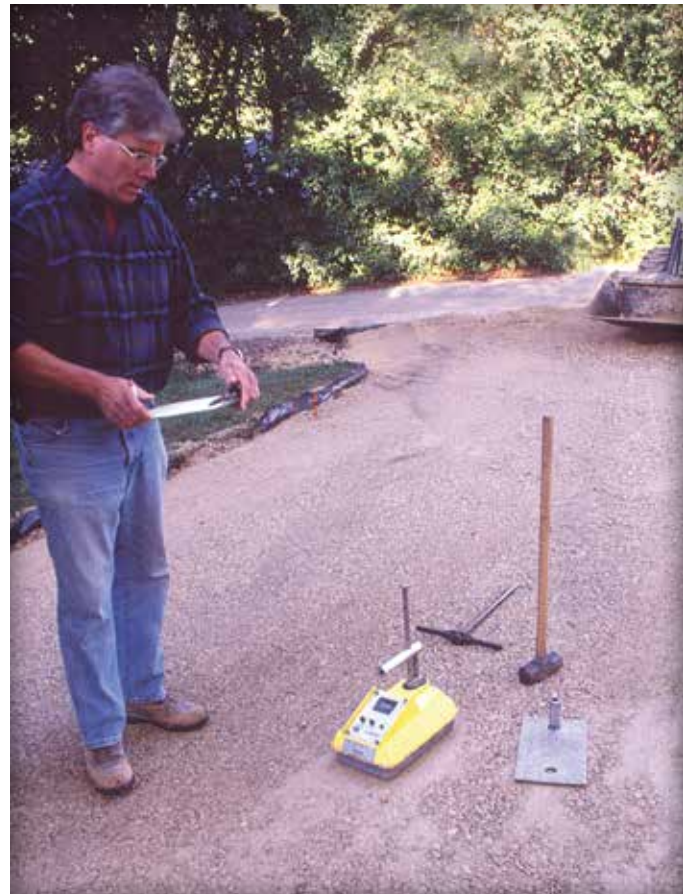
Figure 5. Density testing of the aggregate base with a nuclear density gauge.

Many localities determine base thickness with the 1993 Guide for the Design of Pavement Structures published by the American Association of State Highway and Transportation Officials (AASHTO). The AASHTO procedure calculates the structural number (SN) of the strength coefficients of each base and pavement layer. The SN is