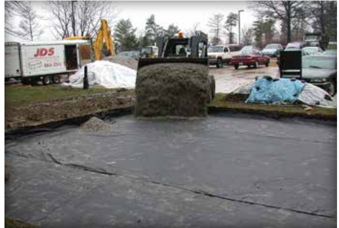
Figure 3. Application of the geotextile under aggregate base.