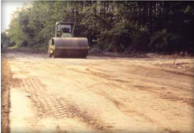
Figure 2. Compacting the soil subgrade.