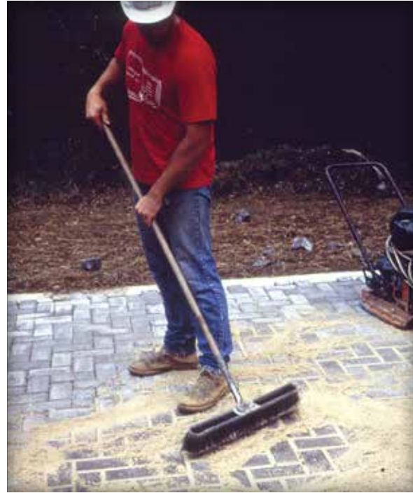
Figure 10. Spreading and sweeping joint sand.

catch basins. These areas should be covered with a geotextile fabric to prevent loss of the bedding sand.