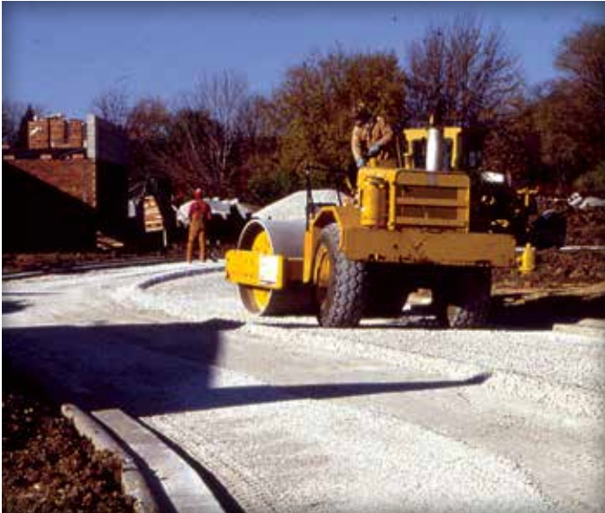
Figure 4. Base compaction with a vibratory roller.

When the fabric is placed in the excavated area, it should be turned up along the sides of the opening, covering the sides of the base layer. There should be no wrinkles on the bottom. When the aggregate is dumped on the fabric, the tires from trucks should be kept off the fabric to prevent wrinkling.