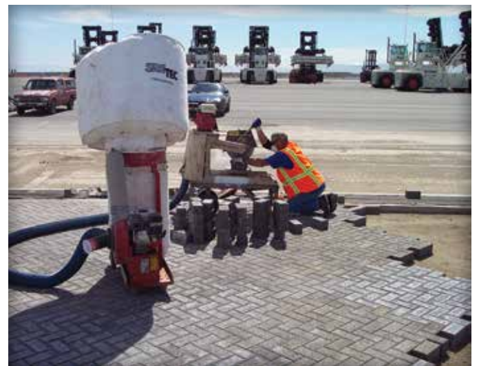
Figure 8. Saw cutting pavers.