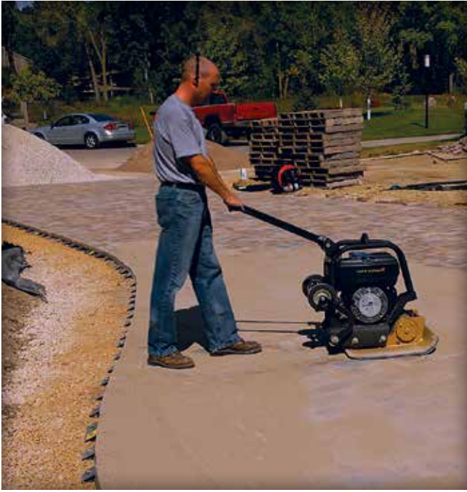
Figure 11. Vibrating sand into the joints.

performance. Certain manufacturers may have materials and data that discuss the potential benefits of shapes on functional and structural performance in vehicular applications. Chalk lines snapped on the bedding sand or string lines pulled across the surface of the pavers are used as a guide to maintain straight joint lines. Buildings, concrete collars, inlets, etc., are generally not straight and should not be used for establishing straight joint lines.