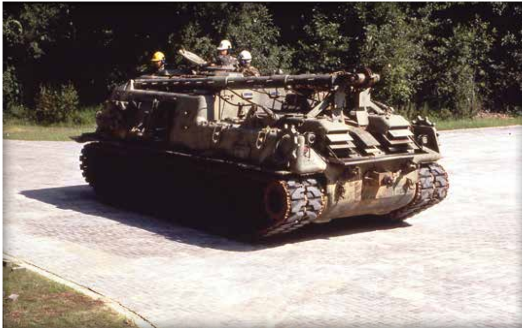
Figure 13. The completed paved area from Figure 12 receives tank traffic at the U.S. Army Proving Grounds in Aberdeen, Maryland.

Final surface elevations should not vary more than \pm 3/8 in. ( \pm 10 mm) under a 10 ft (3 m) straightedge, unless otherwise specified. Bond or joint lines should not vary \pm 1/2 in. (13 mm) over 50 ft (15 m) from taut string lines. The top of the pavers should be 1/8 to 3/8 in. (3 to 10 mm) above adjacent catch basins, utility covers, or drain channels, with the exception of areas required to meet ADA design guideline tolerances. The top of the installed pavers may be 1/8 to 1/4 in. (3 to 6 mm) above the final elevations to compensate for possible minor settling. A small amount of settling is typical of all flexible pavements. Optional sealers or joint sand stabilizers may be applied. Using stabilized sand may have advantages in areas prone to joint sand loss. See ICPI Tech Spec 5—Cleaning, Sealing and Joint Sand Stabilization of Interlocking Concrete Pavement for further guidance.