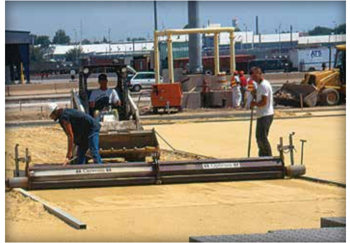
Figure 6a & 6b. Screeding the bedding sand.

determined by assessing the traffic loads, soils, and environmental factors (e.g., drainage, freeze-thaw). The layer coefficient recommended for 3\frac{1}{8} in. (80 mm) thick pavers on 1 in. (25 mm) bedding sand is 0.44 per inch (25 mm), i.e., the SN = 4\frac{1}{8} \times 0.44 = 1.82 . Base thicknesses can be readily determined by using the charts in ICPI Tech Spec 4—Structural Design of Interlocking Concrete Pavement for Roads and Parking Lots or ICPI Structural Design Software. This software is available for free download on www.icpi.org .