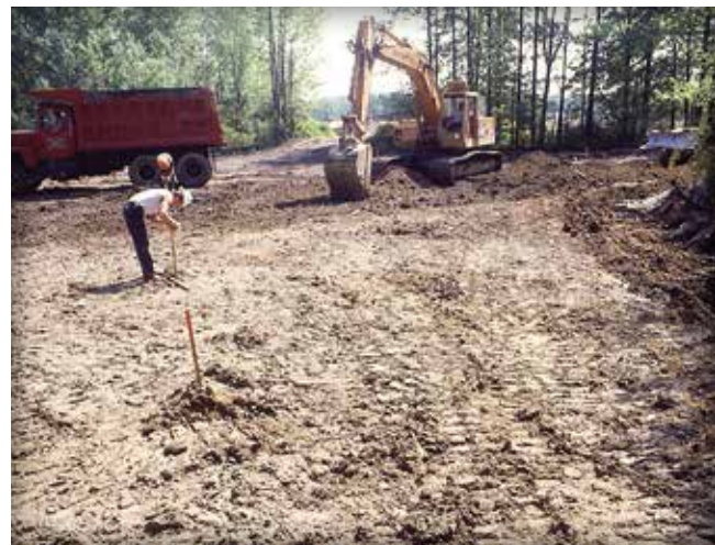
Figure 1. Excavation of the soil subgrade and placing grade stakes.

Installation steps include job planning, layout, excavating and compacting the soil subgrade, applying geotextiles (optional), spreading and compacting the sub-base and/or base aggregates, constructing edge restraints, placing and screeding the bedding sand, and placing concrete pavers. For larger installations mechanical placement of pavers may be more economical. Refer to Tech Spec 11—Mechanical Installation of Interlocking Concrete Pavements for additional information.