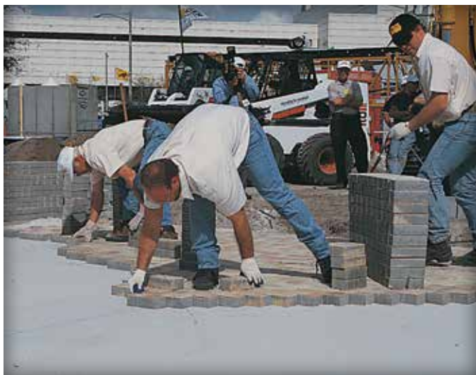
Figure 7. Placing the concrete pavers.

The finished surface of a compacted aggregate base should not allow bedding sand to migrate into it. If the surface will allow ingress of bedding sand, a choke course of fine material can be spread and compacted into the surface, or a bitumen tack coat can be applied. The surface of the base course and its perimeter around the edge restraints should be inspected for areas that might allow sand to migrate after installation. Such locations can be joints in curbs, around utility structures or